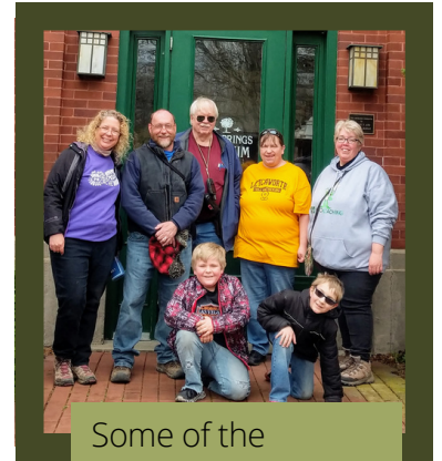
Some of the geocachers who placed the cache at Big Springs stopped in for a tour!

Last year our museum participated in the Livingston County Bicentennial Geocache. Geocaching is an item, typically a container holding a number of other items, that has been hidden at a location whose GPS coordinates have been posted on the internet. Geochachers came from at least 18 states and Canada to find the Livingston County caches. For some finders, one of the Bicentennial Geocaches was their first find. For others, it added to their stats - including the lead finder of geocaches in NY State with well over 130,000 finds! At least a dozen people have found all of the geocaches on this trail and over 215 people have found one or more geocaches on this trail. We will be participating in the trail again this year. If you have not tried geocaching here is your chance. For more information go to Livingston County Bicentennial Geotrail. https://www.livingstoncounty.us/1396/Geocaching